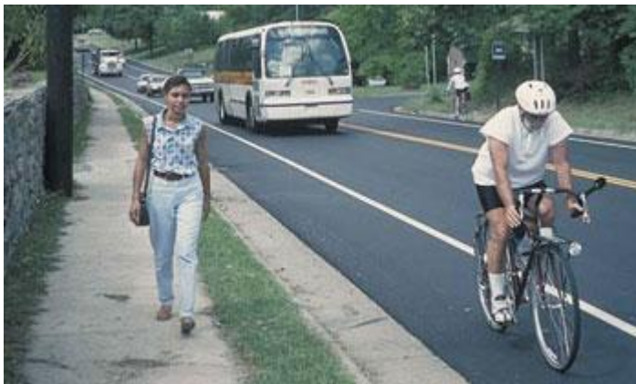
Broad sidewalks and bicycle lanes provide facilities for all modes of travel and improve safety on this street in North Carolina.

Traffic volume is another key factor influencing walkability. High volumes of traffic can inhibit a person's feeling of safety and comfort, and also can affect community life. One San Francisco study showed that people living on a street with light traffic (2,000 vehicles per day) have three times as many friends and twice as many acquaintances on the street as do people living on a street with heavy traffic (16,000 vehicles per day). By designing streets that accommodate lower speed limits or by using traffic-calming approaches (e.g., curb extensions or roadway narrowing), designers and engineers can make streets more pedestrian-friendly. These changes also will benefit motorists and cyclists by creating streets that are safer.