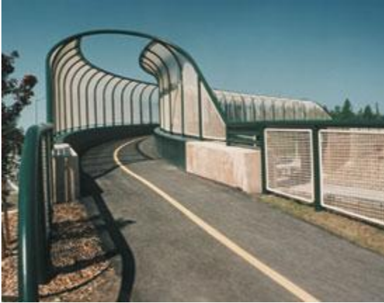
This pedestrian bridge crosses Tudor Road in Anchorage, AL.

Speeding is another contributing factor, playing a part in 29 percent of all fatal crashes involving pedestrians in 2000. At higher speeds, motorists are less likely to see a pedestrian and are even less likely to be able to stop in time to avoid hitting one. A pedestrian hit at 64.4 kilometers per hour (40 miles per hour) has only a 15 percent chance of survival, whereas a pedestrian hit at 32.2 kilometers per hour (20 miles per hour) has a 55 percent chance of survival. At 49.9 kilometers per hour (31 miles per hour), a driver will need about 61 meters (200 feet) to stop, which may exceed available sight distance; at a speed of 30.6 kilometers per hour (19 miles per hour), the stop time is halved.