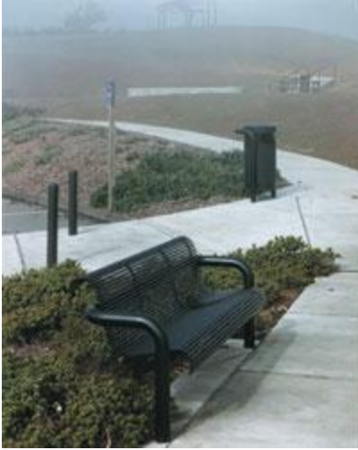
A pedestrian walkway in Benicia Vista Point, CA, located on Route 680.