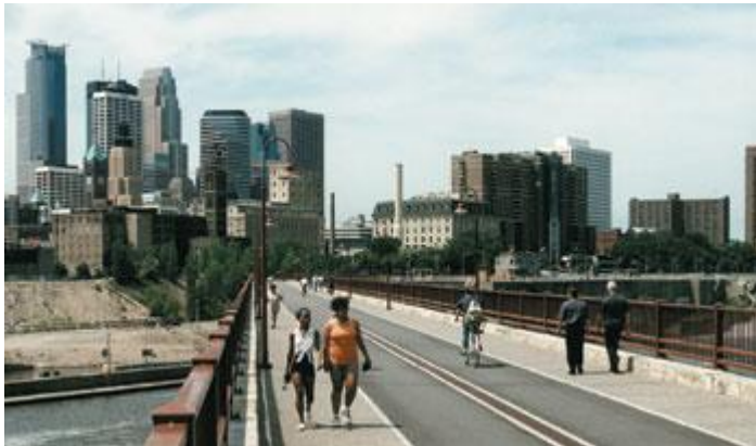
Strollers enjoy the historic Stone Arch Bridge, which was restored in Minneapolis, MN, in 1994.

With an estimated 78,000 pedestrians injured or killed in 2000 in motor vehicle crashes, the need for increased pedestrian safety in the United States is urgent. In 2000, a total of 4,763 pedestrians were killed in motor vehicle crashes, representing 11 percent of total motor vehicle deaths nationwide. Although statistics from the National Highway Traffic Safety Administration (NHTSA) show that the figures have declined in recent years, there is little reason for optimism. The decline is a result of a decrease in the relative number of people walking—not necessarily due to a safer walking environment. As cities continue to grow and the average vehicle miles traveled continue to increase, U.S. transportation and planning specialists have been left with a daunting challenge: to reduce pedestrian deaths and injuries while promoting increased walking.