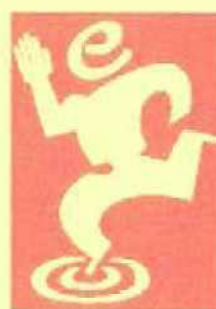
District of easington