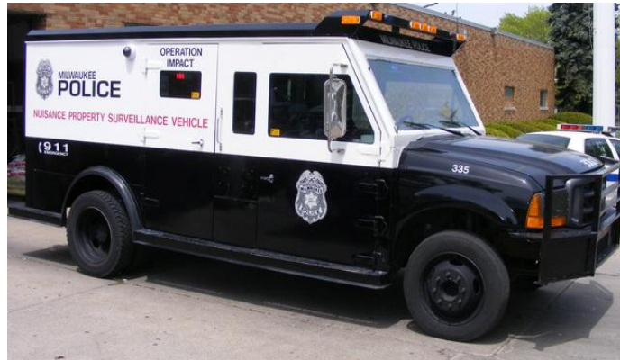
Milwaukee, Wisconsin Police Department's Nuisance Surveillance Vehicle