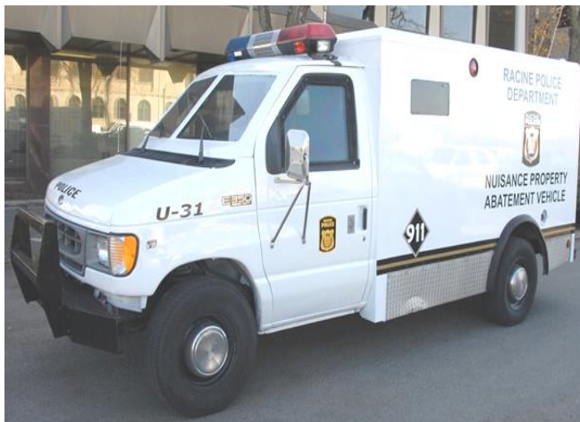
The "NPAV" Racine, Wisconsin Police Department