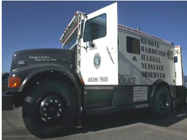
The Panama City, Florida Police Department's "RHINO"