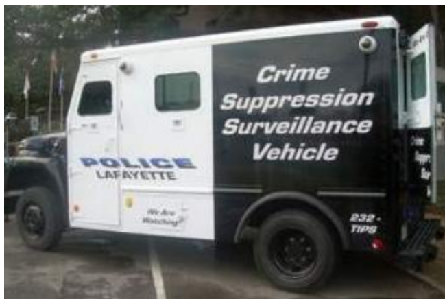
Lafayette, Louisiana Police Department's "Armadillo"