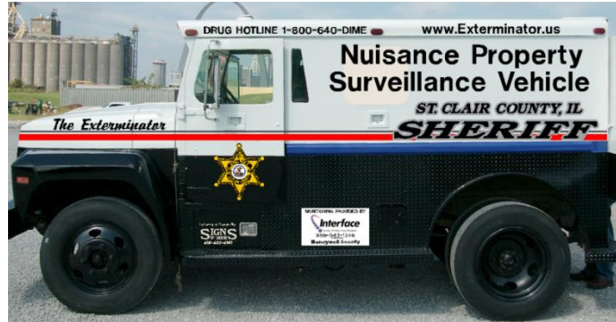
The "Exterminator" St. Clair County, Illinois Sheriff's Department