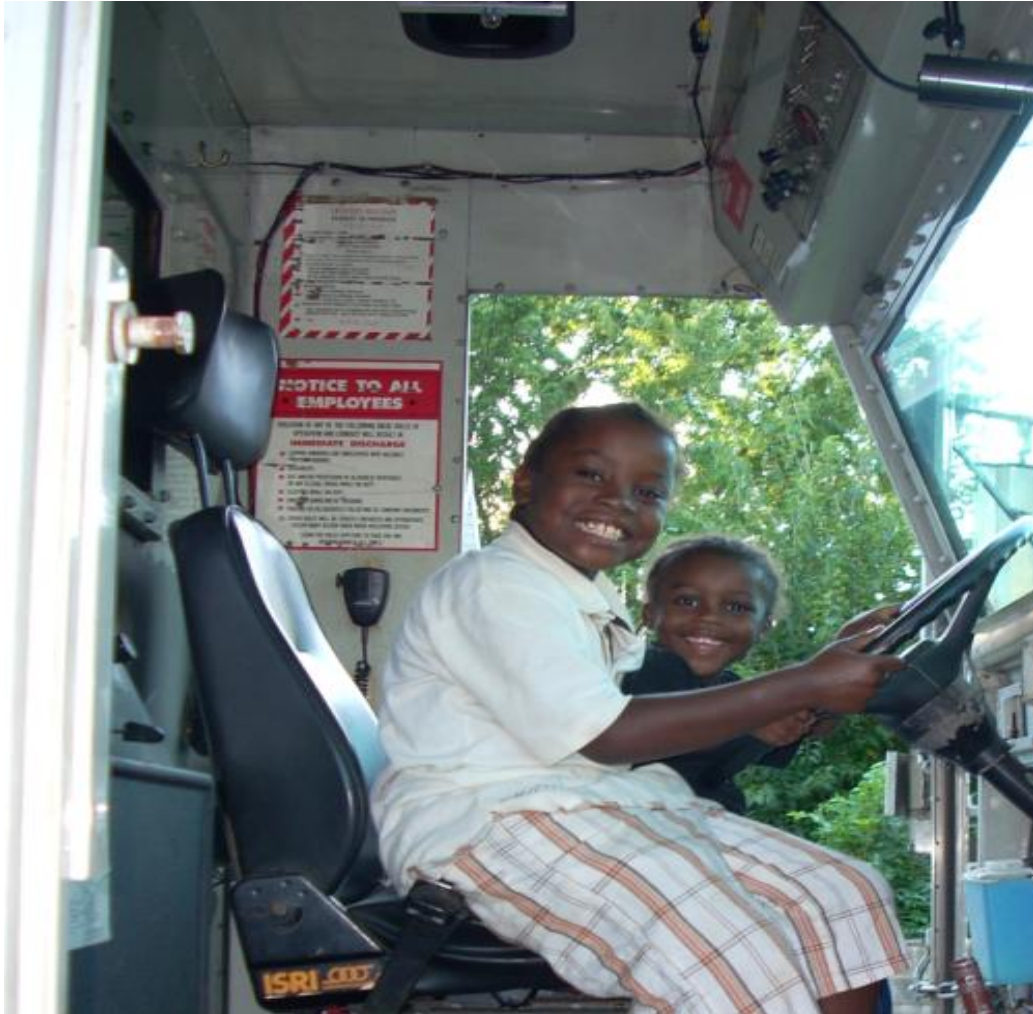
Two youngsters at a neighborhood association event