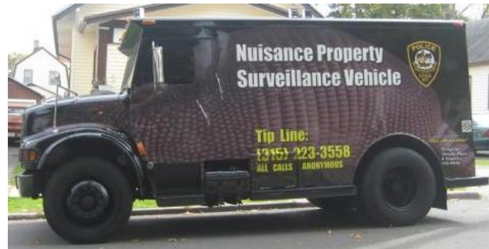
The "Armadillo" Utica, New York Police Department