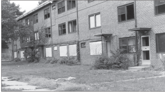
Urban areas with poorly-maintained, high-density low-income housing are often the site of open-air drug markets.

Key figures in the function of open-air drug markets are “place managers” such as landlords, housing authorities, local business residents and tenants associations. Those who diligently control their apartment buildings or the business premises forecourt will reduce the chance of an illicit market becoming established in their neighborhood, and drug sellers will often operate from locations where place managers do not attempt to exert any control over illicit activity. 15 Open-air drug markets are therefore more likely to become established in areas where there is a high rate of rental properties and/or public housing rather than in owner-occupied neighborhoods.