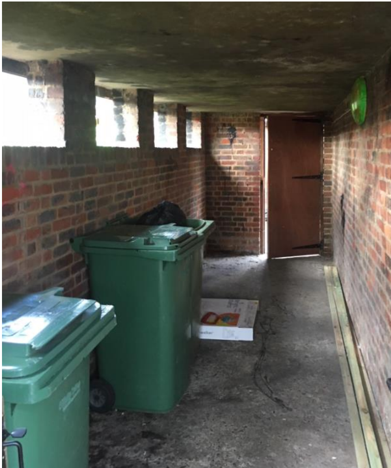
Image 3. Bin Store