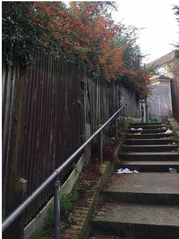
Image 8 Side Alley